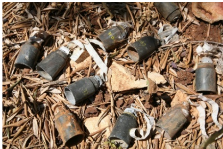
Cluster Bombs in an Olive Grove

The fuze of each submunition is generally activated as it falls so that it will explode above or on the ground. But often large numbers of the submunitions fail to work as designed, and instead land on the ground where they remain as very dangerous duds (see photo at left). Like landmines, these submunitions can remain a fatal threat to anyone in the area long after a conflict ends.