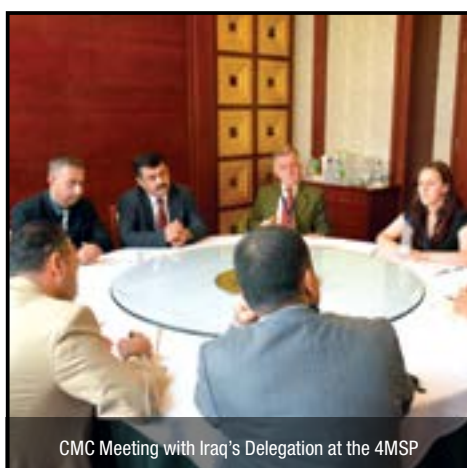
CMC Meeting with Iraq's Delegation at the 4MSP

All meetings are opportunities for networking, advocacy, hosting side events on your work, publishing and launching reports, and more. They are also key milestones at which your country's government could announce and receive positive attention for steps forward on the ban. A calendar of events can be found on the Cluster Mmunition Coalition website.