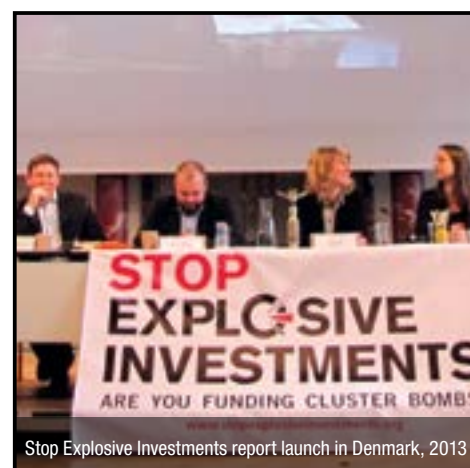
Stop Explosive Investments report launch in Denmark, 2013