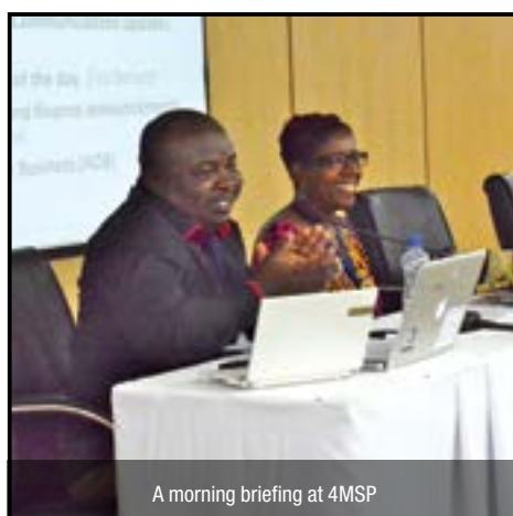
A morning briefing at 4MSP