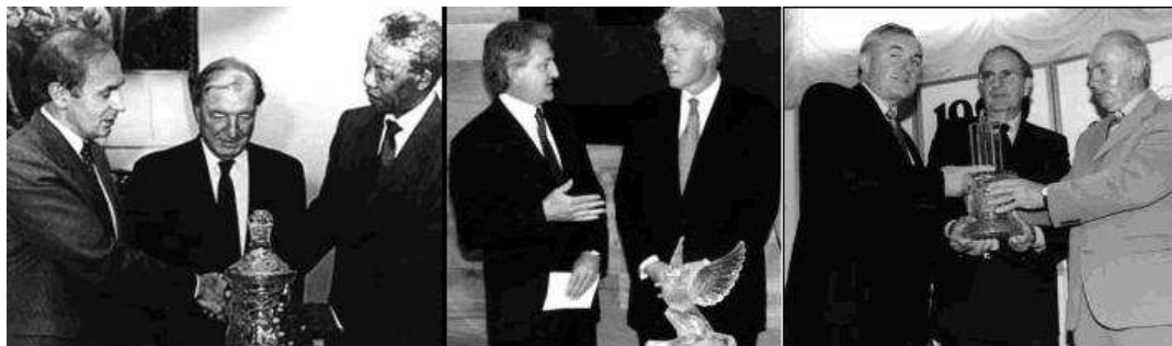
Tipperary Peace Award Recipients Nelson Mandela, Bill Clinton and US Senator George Mitchell